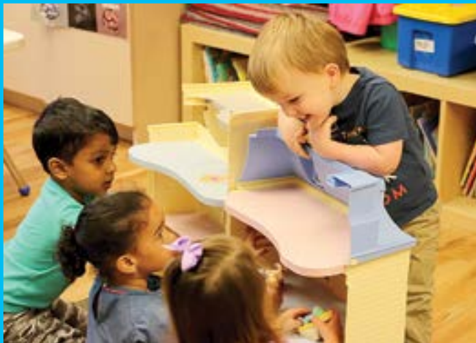
Cherishing Childhood - Valuing Education