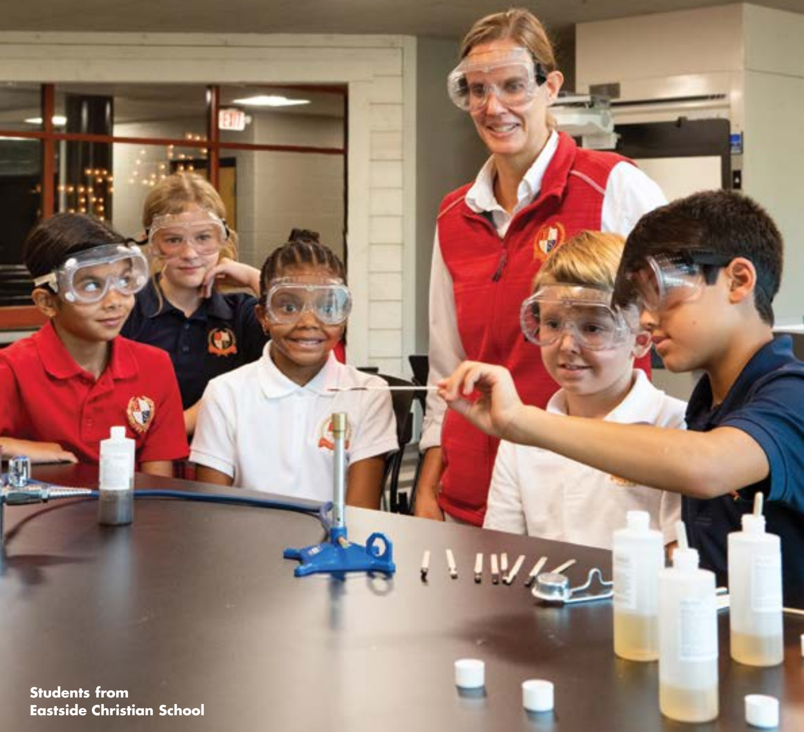
Students from Eastside Christian School

Community Calendar PAGES 14-18 | Halloween Happenings PAGES 20-21