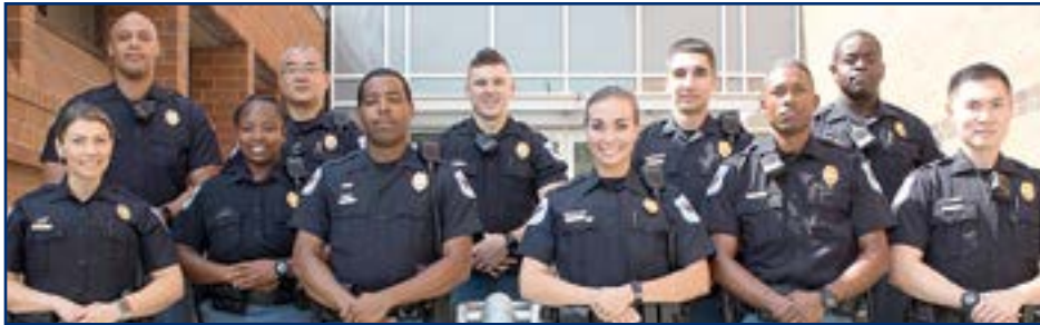
Cobb County Police