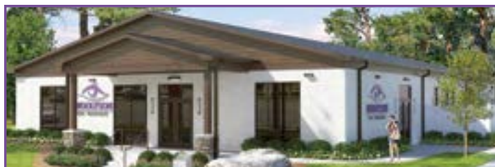
Woolfson Eye Institute is located at 2687 Sandy Plains Road